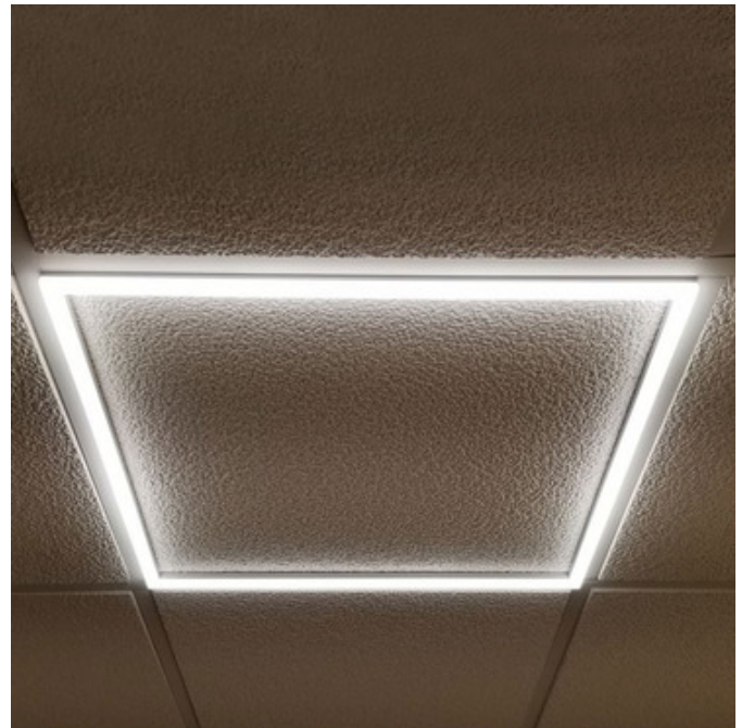
Shown in: Diffused Lens

The 2 X 2 Edge Lit LED Color/Wattage Select Panel is an ideal replacement for traditional flat panels and troffers at a fraction of the cost. Includes a driver with a switch for selectable power consumption (20W-30W-40W with 2500-5000 lumens) and selectable color temperatures (3500K - 4000K - 5000K). Non-flicker, no dark spot. Note: Optional extension cords for remote driver placement and mounting accessories are available sold separately. DLC premium.