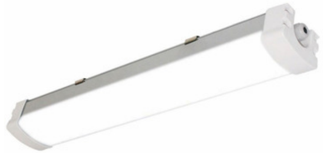
Shown in: Gray

The Triproof Wall / Ceiling Light features a durable lighting solution that can replace traditional linear fluorescent luminaires. 100-240V/277V input. Available with a 120 degree beam angle. Optional accessories sold separately. IP66 water proof. IK10 Impact Resistant. Vandal Resistant. Tri-Proof Lights are designed for a variety of applications requiring, dust, moisture and impact-resistance. Suitable environments such as corridors, stairwells, warehouses, parking garages and car washes allows this versatile fixture in a variety of applications. DLC listed. ETL listed.