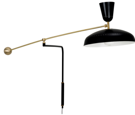
Shown in black / brass / matte black

The G1 Wall Sconce features a magisterial and timeless design that has an embossed metal lampshade and two light sources allowing for direct and indirect lighting. Articulated arm with brass ball counterweight. Includes 78.74 inch cord with dimmer switch on cord.