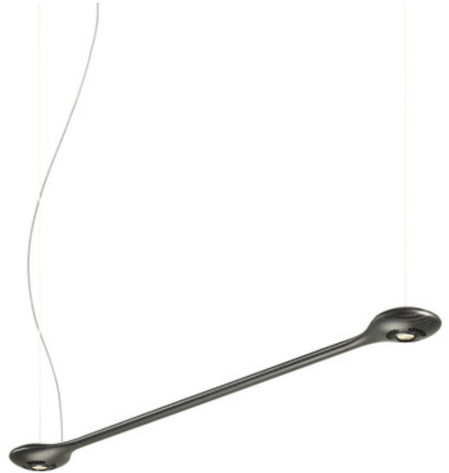
Shown in: Carbon Fiber

The Carbon Linear Pendant is a high performance modular suspension light that uses the latest technology, such as a carbon fiber body that makes the fixture feather light. With an adaptable design and multiple lighting options, this fixture allows you to create the optimum levels of illumination for any space while also standing as a focal point for the room. Available with a carbon fiber finish in 2-Light, 3-Light, 4-Light, or 5-Light options. 2700K and 4000K color temperatures available, as well as three options for the LED beam angle. Canopy size: 8.1in. x 6.3in. cETL listed.