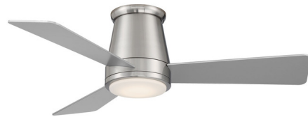
Shown in brushed nickel / brushed nickel