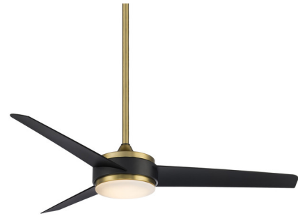
Shown in satin brass / matte black