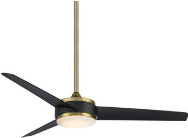
Shown in: Satin Brass / Matte Black

The Mod Ceiling Fan integrates functionality and innovation with a stylish aesthetic that is visually compelling. Three blades are set at a 16 degree pitch combined with a powerful 188x10 DC motor that has six speeds and is reversible. The Mod Ceiling Fan can be used with the WAC Lighting Smart Fan app to control the speed, direction, and light of the fan. You can also connect with Google Assistant, Amazon Alexa, Samsung Smart Things, Ecobee Control4, and Josh AI making this fan the perfect addition to a smart and connected home. The Mod Ceiling fan comes with a hand held remote (F-RCBT-WT). An integrated LED which can be replaced provides ample amounts of light and can be dimmed. Also included is a 6 inch downrod. The fan can be installed on sloped ceilings up to 32 degrees, up to 45 degrees with the addition of a Sloped Ceiling Kit (sold separately). Available with a Satin Brass motor with Matte Black blades or a Matte Black motor with Distressed Koa blades. ETL, cETL, UL, cUL, CSA rated. Title 24/JA8 and Title 20 compliant. Energy Star rated. DC motor. Wet locations.