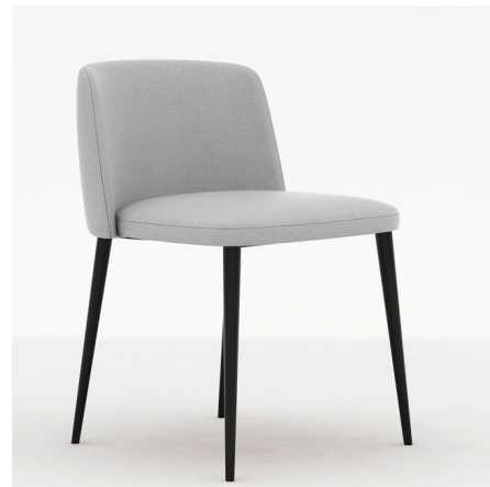
Shown in black / silver cloud

The Ballet Dining Chair features an ultra-slick and streamlined design with a curved metal framed backrest which demonstrates the impeccable workmanship and meticulous spirit of this chair. Available with a Silver Cloud fabric or Clay Leather upholstery complemented by Black metal hardware.