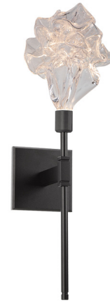
Shown in matte black / clear

PRODUCT DIMENSIONS . . . . . Backplate: 4.5" Sq. COLOR RENDERING . . . . . 93 CRI LAMP COLOR . . . . . 3000K LUMENS/WATT . . . . . 65.38 LUMINOUS FLUX . . . . . 340 lumens