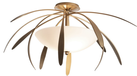
Shown in soft gold / opal

The Dahlia Semi Flush Ceiling Light enhances any interior environment with its exquisite botanical design. The handcrafted forged steel petals extend gracefully from the canopy, surrounding the glass bowl diffuser. Lifetime Limited Warranty when installed in residential setting. Handcrafted to order by skilled artisans in Vermont, USA.