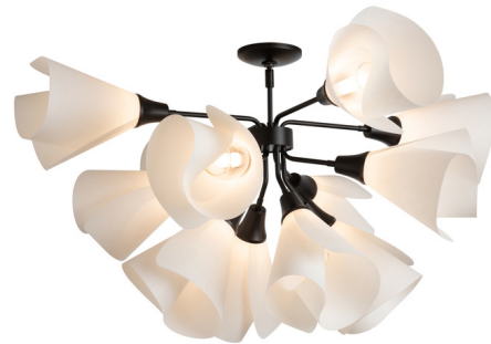
Shown in black / spun frost