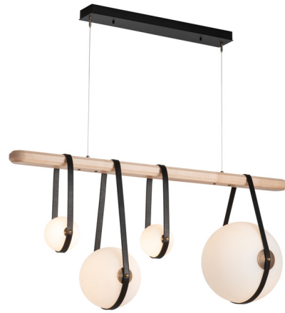
Shown in antique brass / black leather / maple wood

The Derby Linear Pendant is like nothing you've ever seen before. Leather straps made by local New England Artisans are embossed with HF's mark. Available with a Maple Wood or Black Wood bar that holds the Leather Straps with steel accents and Opal glass globes. Available with Black, Chestnut, or British Brown leather straps and Antique Brass or Polished Nickel rivets. Choice of 4 or 5 lights. Canopy: 27.5 inch x 4.5 inch rectangle. Slope ceiling adaptable to 45 degrees. Handcrafted by skilled artisans in the USA.