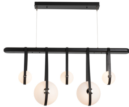
Shown in polished nickel / black leather / black wood

The Derby Linear Pendant is like nothing you've ever seen before. Leather straps made by local New England Artisans are embossed with HF's mark. Available with a Maple Wood or Black Wood bar that holds the Leather Straps with steel accents and Opal glass globes. Available with Black, Chestnut, or British Brown leather straps and Antique Brass or Polished Nickel rivets. Choice of 4 or 5 lights. Canopy: 27.5 inch x 4.5 inch rectangle. Slope ceiling adaptable to 45 degrees. Handcrafted by skilled artisans in the USA.