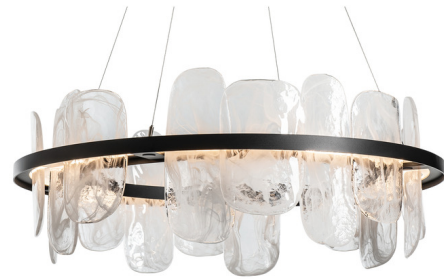
Shown in black / white swirl

The Vitre Circular Pendant brings a stunning depth and beauty to your interior space. Exquisite thick handmade glass panels with abstract White Swirls create warm up and down light. Canopy: 8.8 inch diameter. Slope ceiling adaptable to 45 degrees. Dimmable with LV Electronic or 0-10V dimming. Lifetime Limited Warranty when installed in residential setting. Handcrafted to order by skilled artisans in the USA. Note: Requires a special rated junction box for fixtures weighing over 50 pounds.