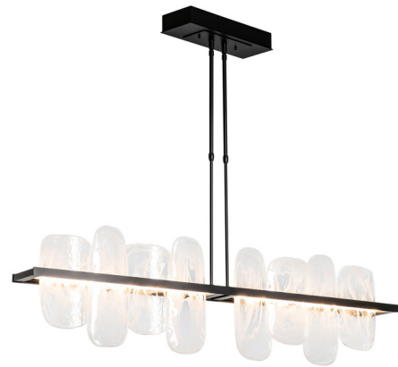
Shown in black / white swirl

PRODUCT DIMENSIONS . . . . . Min/Max Adjustable Length: 40.3" - 51.6" COLOR RENDERING . . . . . 90 CRI LAMP COLOR . . . . . 3000K LUMENS/WATT . . . . . 44.39 LUMINOUS FLUX . . . . . 2530 lumens