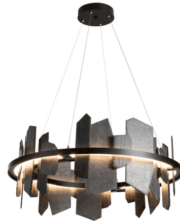
Shown in black / vermont slate