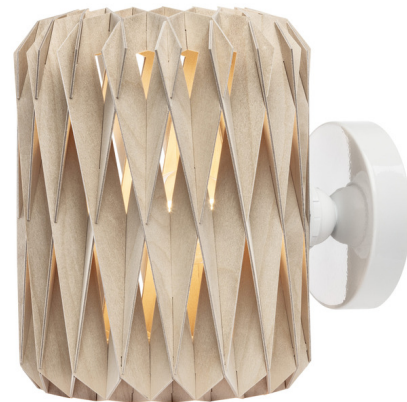
Shown in white / birch

COLOR RENDERING . . . . . 90 CRI LAMP COLOR . . . . . 3000K