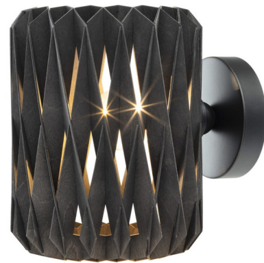
Shown in black / black

The Pilke Wall Sconce was created by the industrial designer Tuukka Halonen. Pilke is a Finnish word that means twinkle. Pilke shades are constructed of identical interlocking parts and the repetition of plywood parts which creates a beautiful three dimensional, geometrically decorative light shade. Pilke is entirely made in Finland of birch plywood and assembled by local craftsmen. Available with a White stain and White finish, Black stain and Black finish, or Natural birch diffuser and White finish. Mounts directly to standard junction box. UL listed.